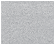
Non-Painted ACRYLIC COATED GALVALUME®